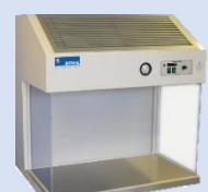
Clean air products

www.bassaire.co.uk | Tel: +44 (0) 1489885111 | Email: sales@bassaire.co.uk