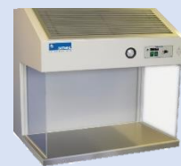
Clean air products