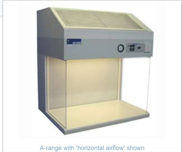
A-range with 'horizontal airflow' shown

Each unit is available with a choice of airflow modes: